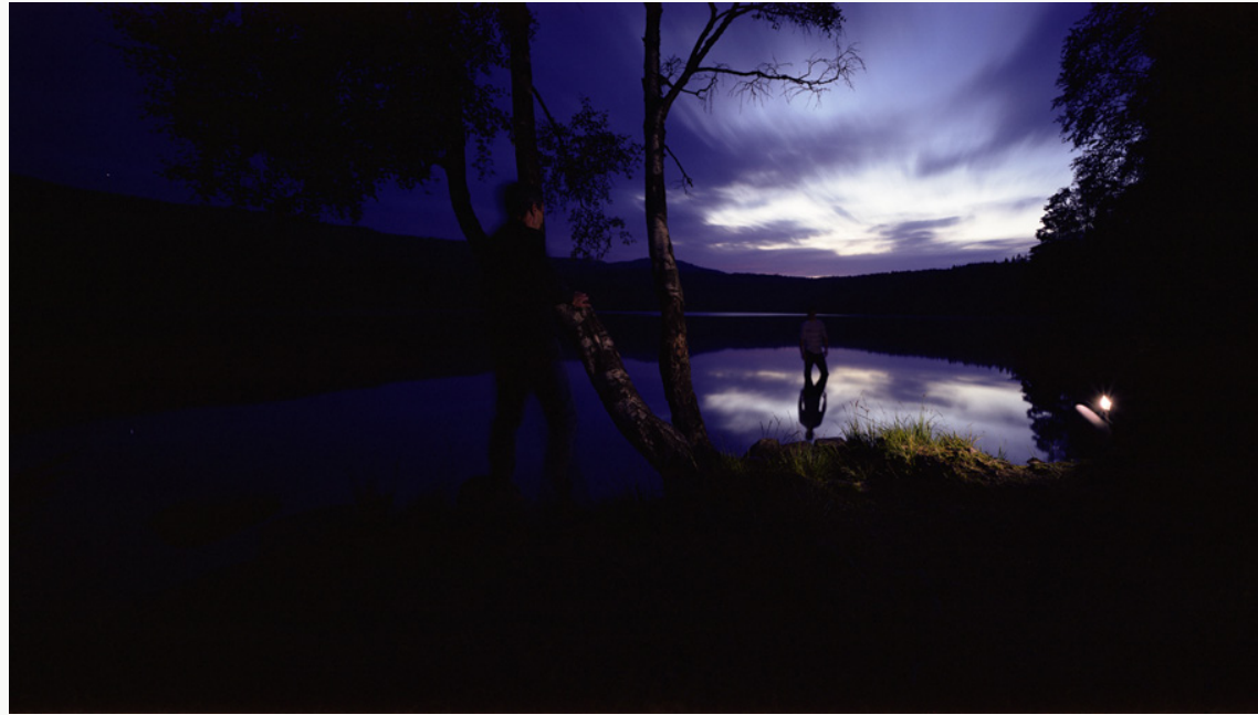
In the Company of Wolves #1 (2006) Diasc print (1000 x 960 mm) Edition of 5