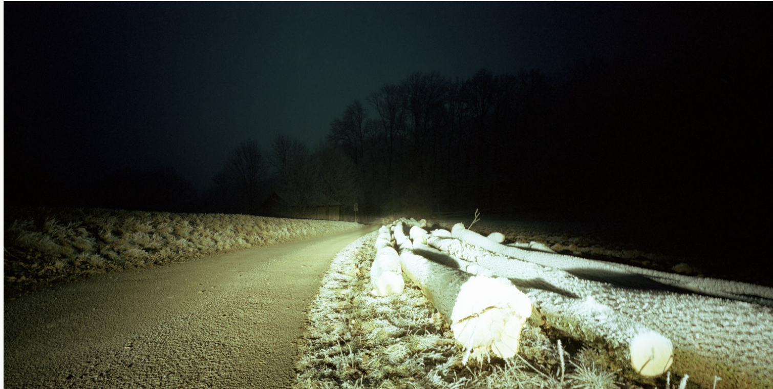
The Tale Of Our Purloined Breath #1 (2008) Diasec print (1400 x 700 mm) Edition of 3