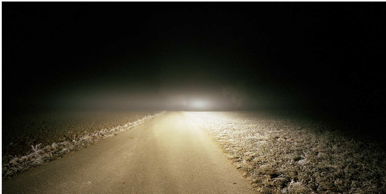
The Tale Of Our Purloined Breath #2 (2008) Diasec print (1400 x 700 mm) Edition of 3