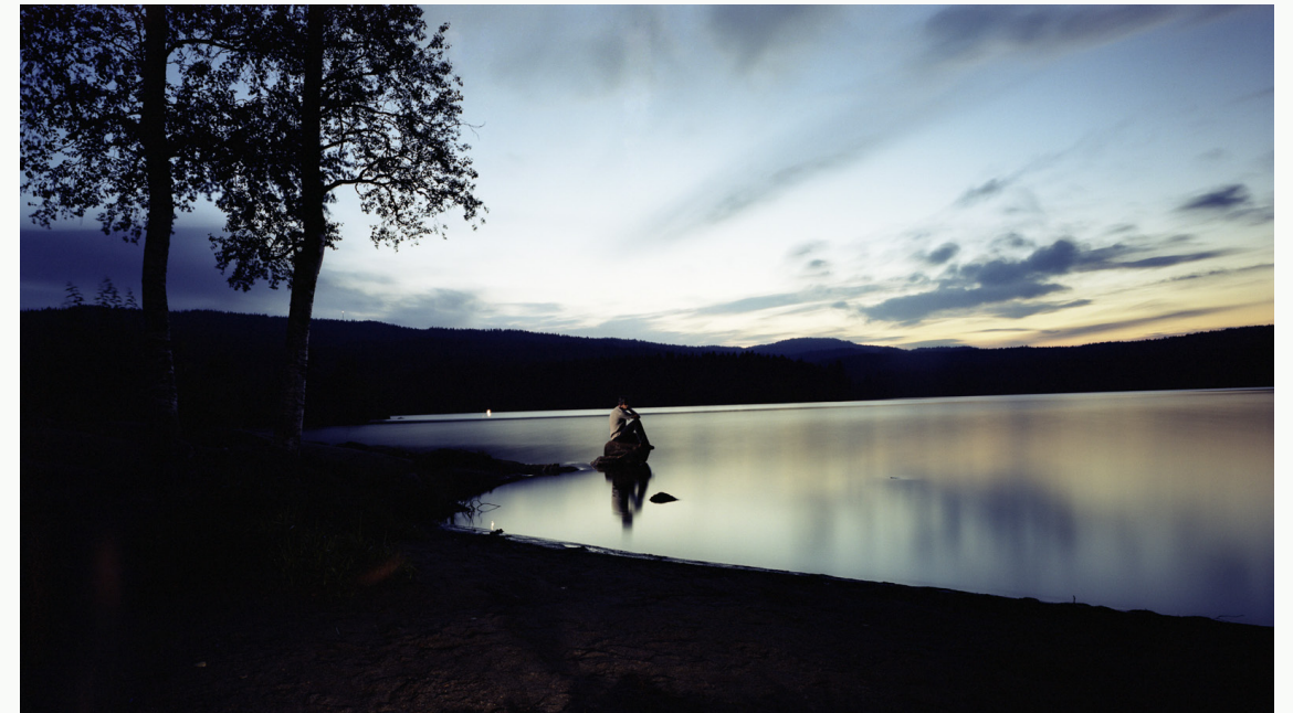
Walter Auf Dem Steine (2006) Diasc print (1000 x 580 mm) Edition of 5