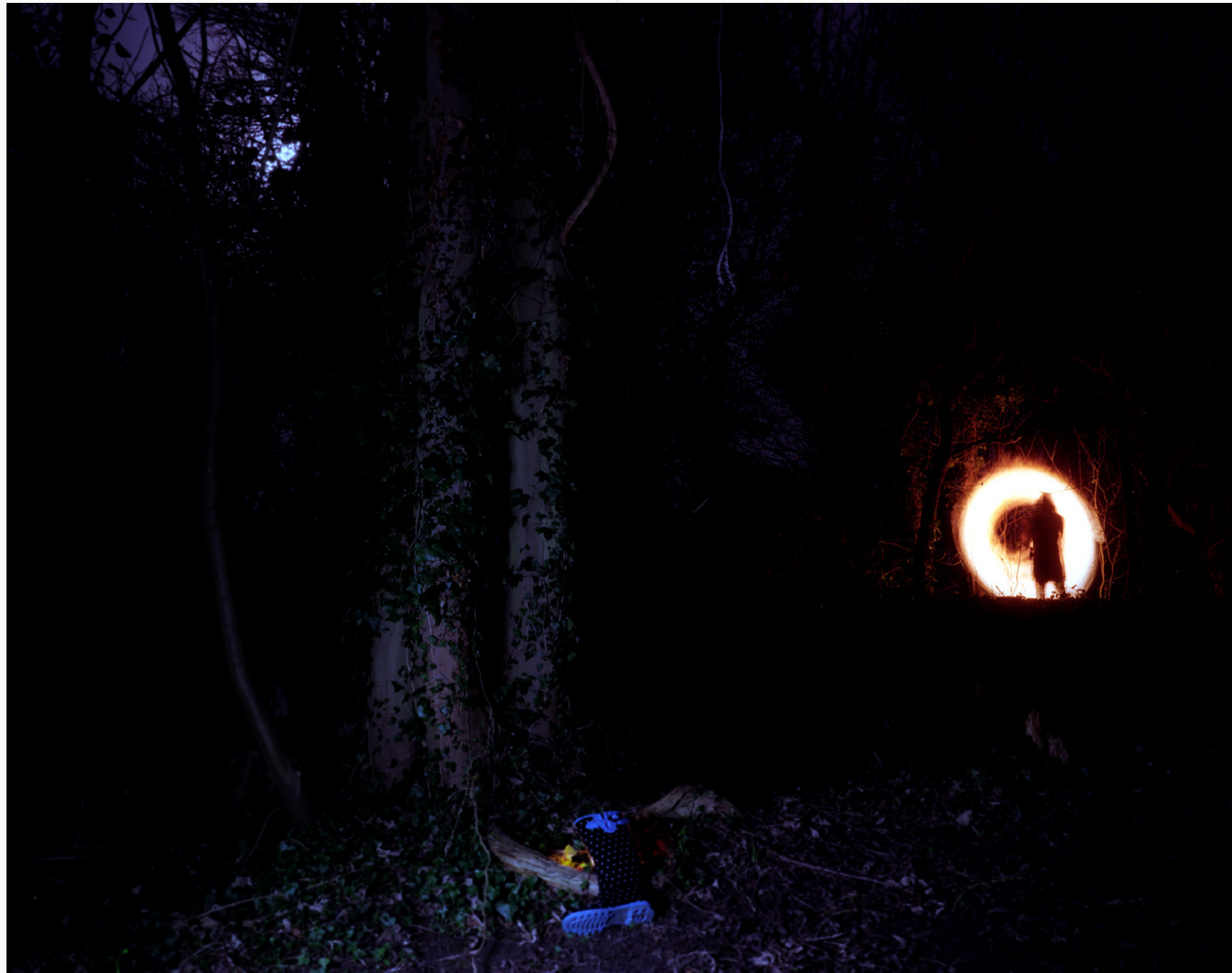
The One Who Went Forth To Learn What Fear Was #3 (2005) Diasc print (1200 x 960 mm) Edition of 5