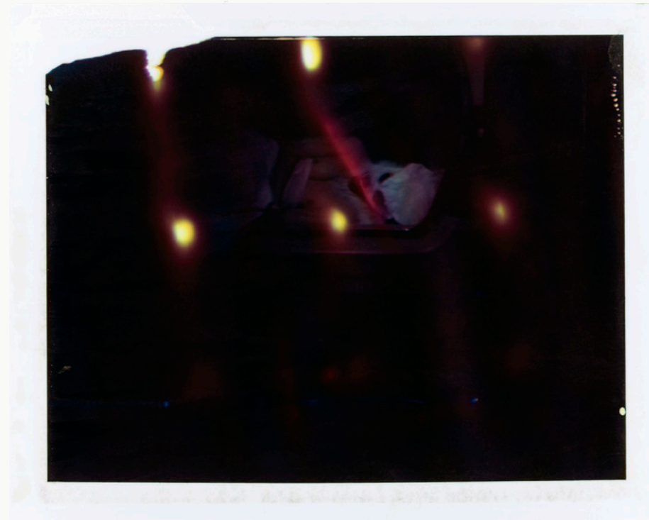
Polaroids [The Night] (2008) Original Polaroids Digital C-Type Prints 230 x 255mm