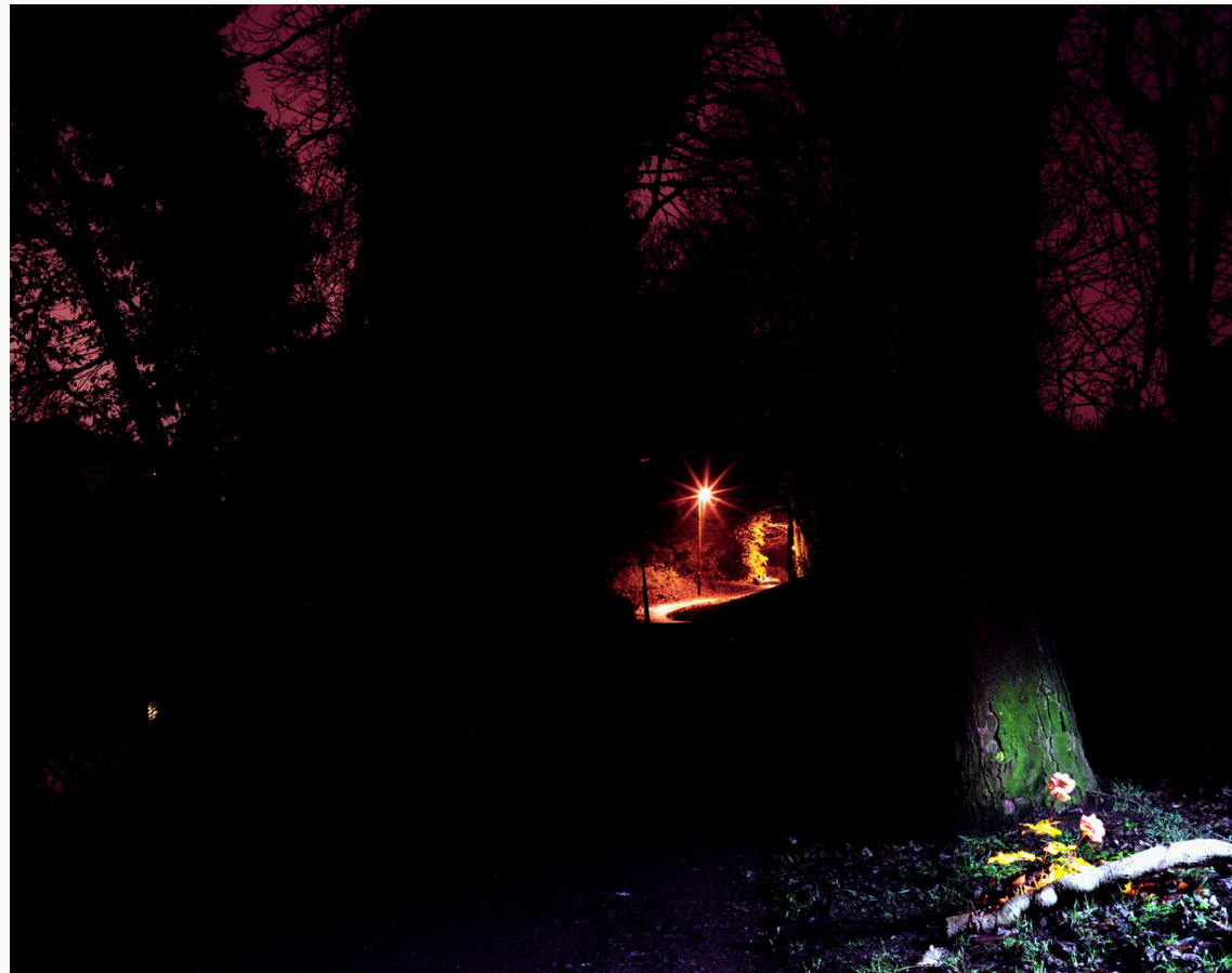
The One Who Went Forth To Learn What Fear Was #1 (2004) Diasc print (1200 x 960 mm) Edition of 5