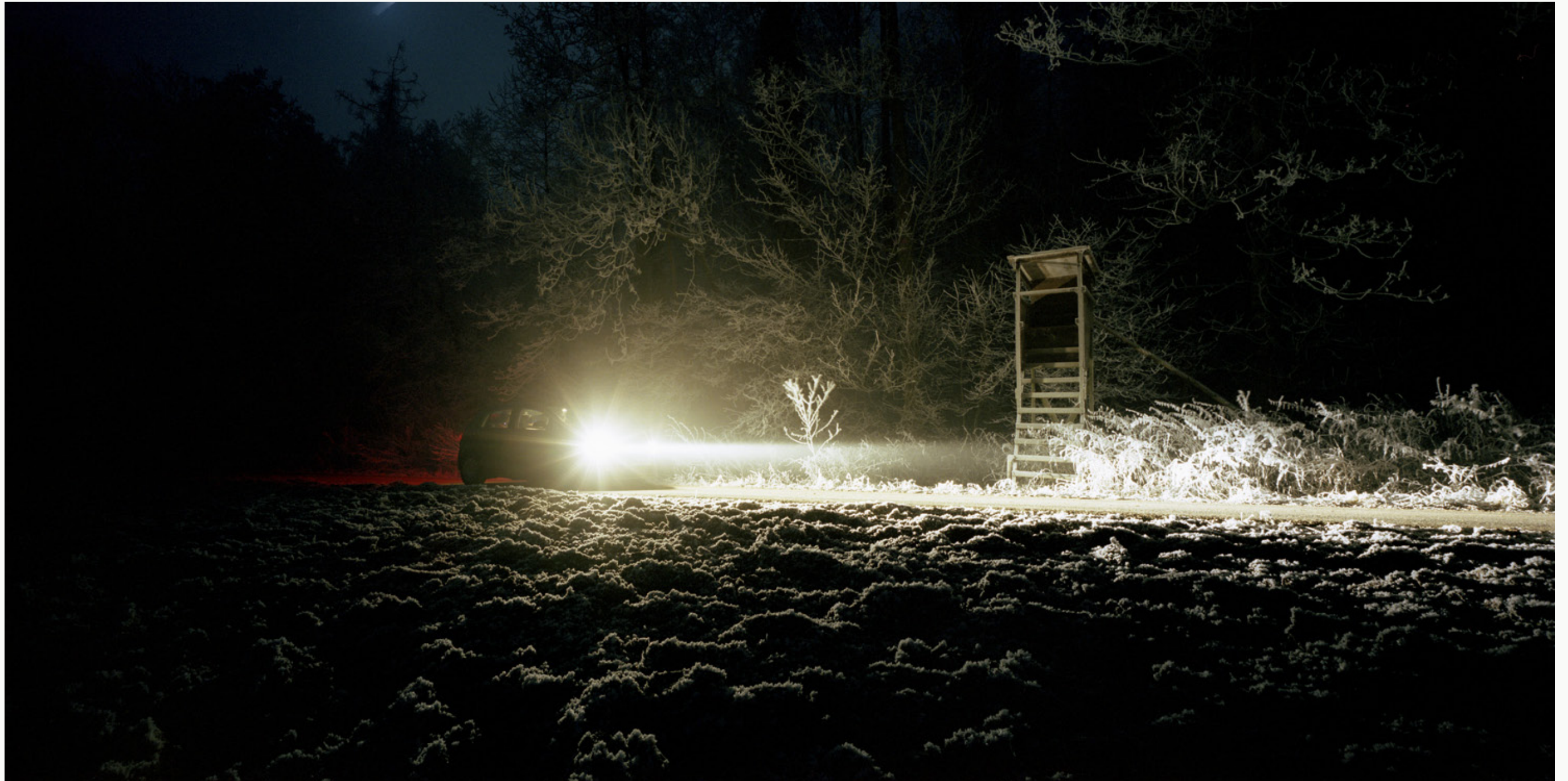
The Tale Of Our Purloined Breath #3 (2008) Diasec print (1400 x 700 mm) Edition of 3