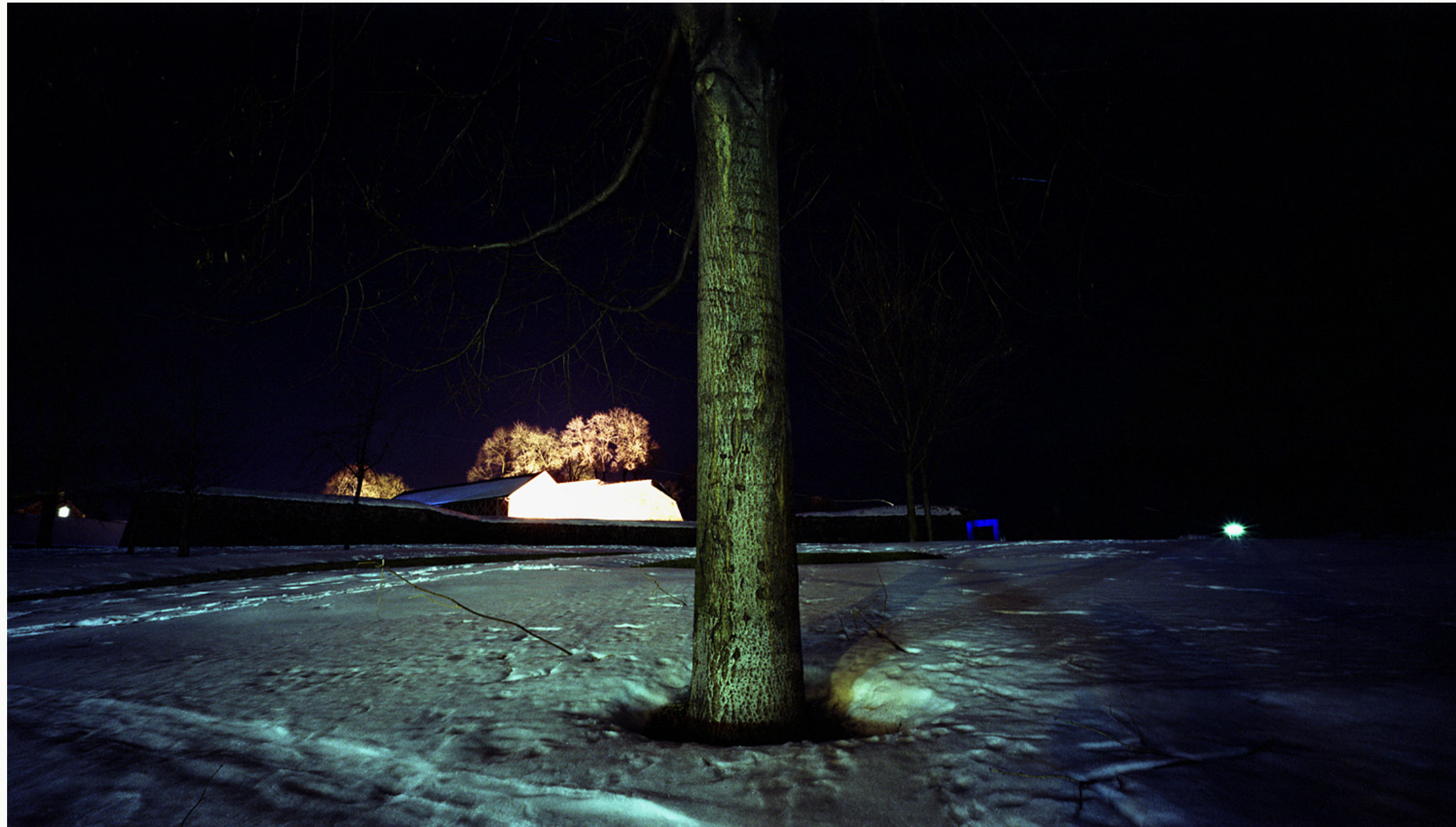
Green Tree, Oslo (2006) Diasec print (1230 x 700mm) Edition of 5