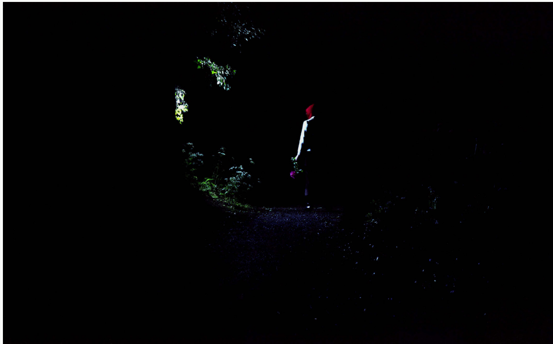
So As I Might See You Better #1 (2005) Diasc print (1550 x 960 mm) Edition of 5