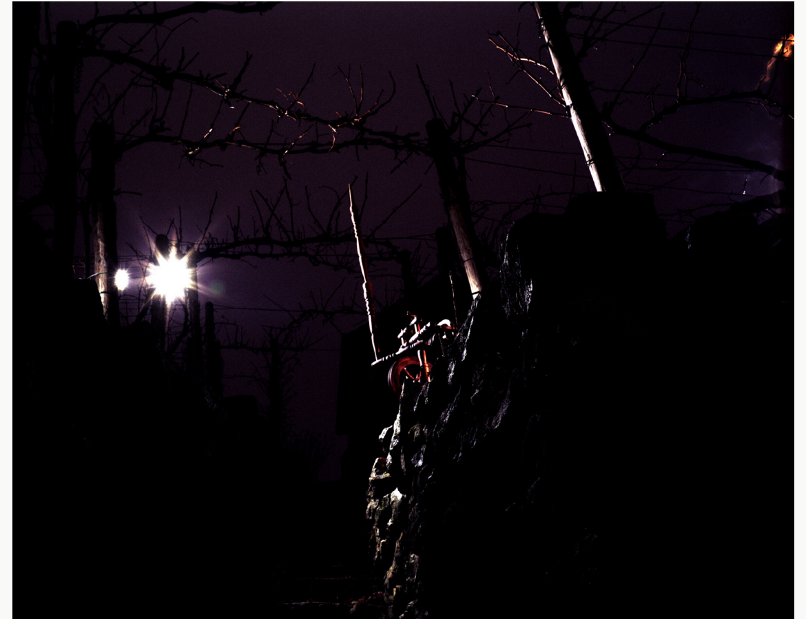
The One Who Went Forth To Learn What Fear Was #2 (2005) Diasc print (1200 x 960 mm) Edition of 5