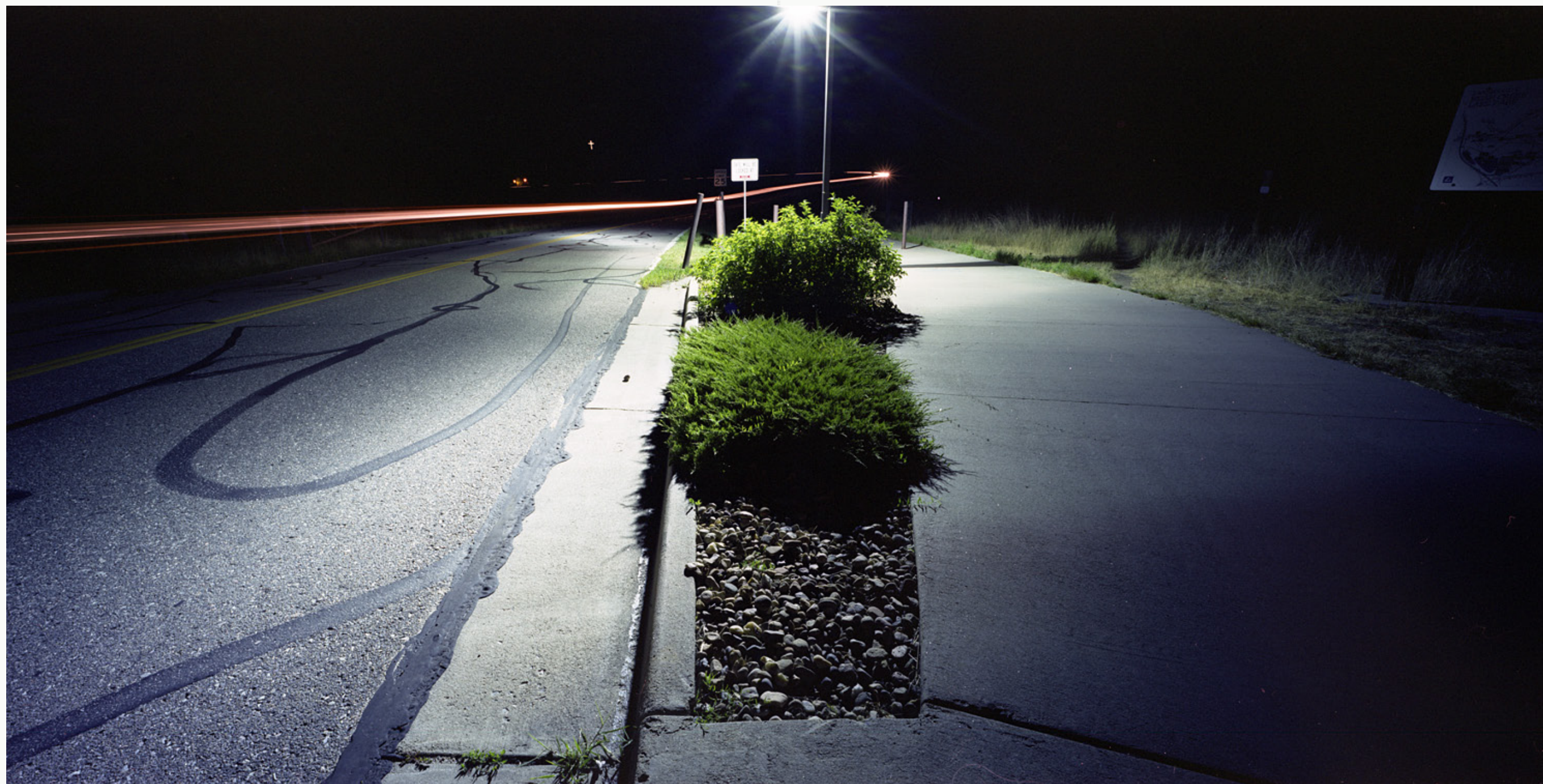
Neon Cross in the Mountains, Denver (2008) Diasc print (1400 x 700 mm) Edition of 3