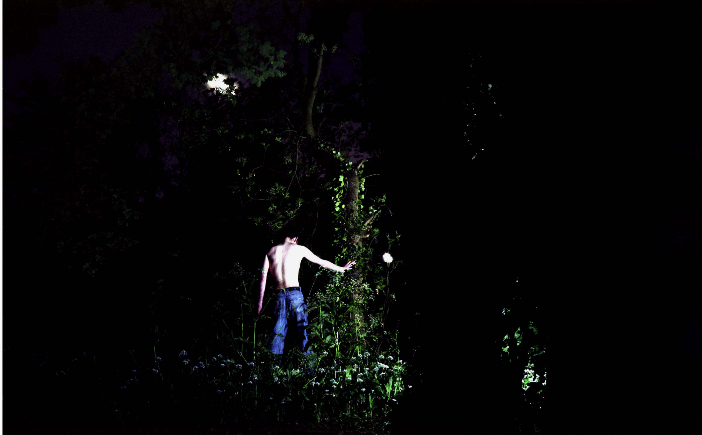
So As I Might See You Better #3 (2005) Diasc print (1550 x 960 mm) Edition of 5