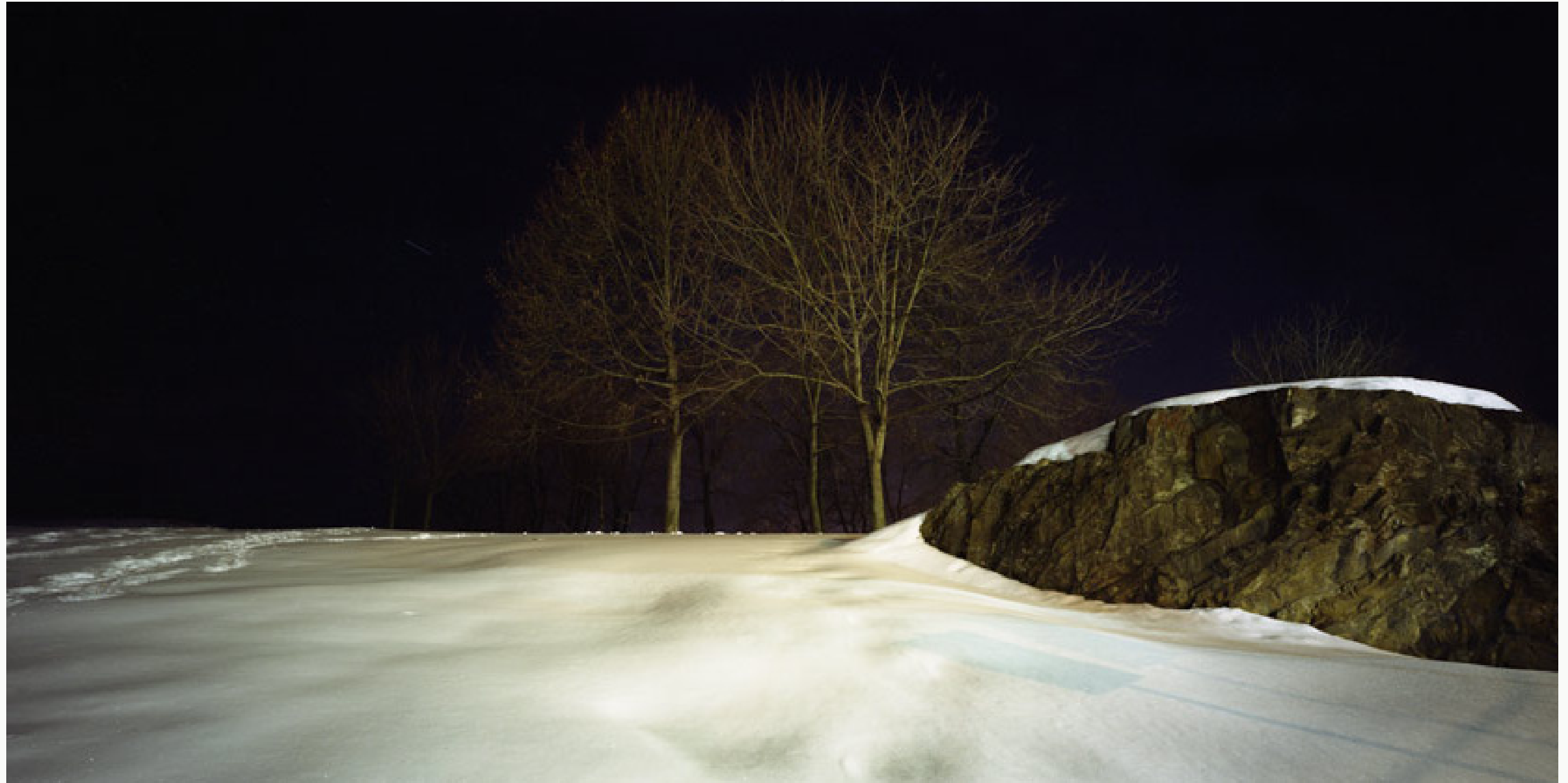
Two Trees, Oslo (2006) Diasec (1400 x 700 mm) Edition of 3