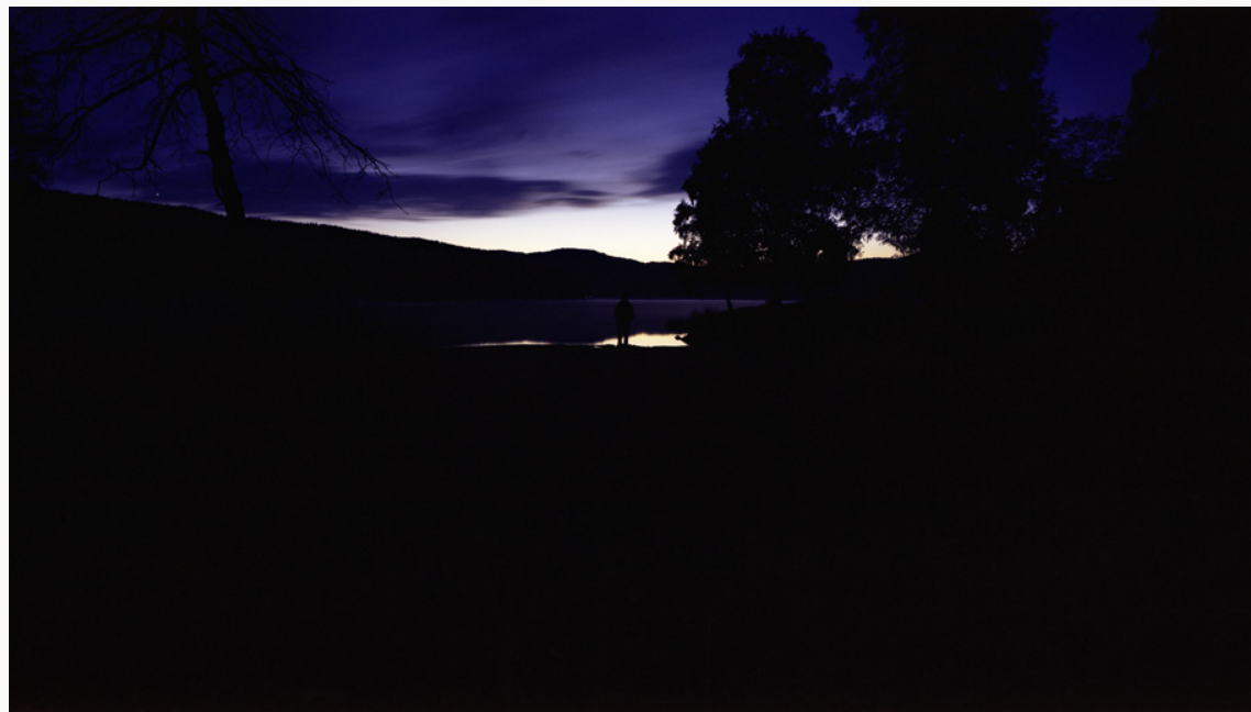
In the Company of Wolves #2 (2006) Diasc print (1000 x 960 mm) Edition of 5