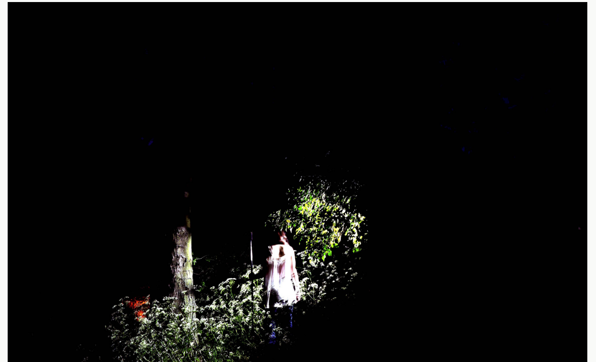
So As I Might See You Better #2 (2005) Diasc print (1550 x 960 mm) Edition of 5